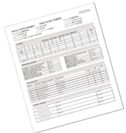
Gemini Cut Plan - order cutting report